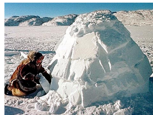
- Greg Dial

Sin entices and seduces us in precisely the same way. Satan lures us to the place where he plans to ravage us with some sort of destructive fleshly pleasure -- gossip, rage, sexual sin, etc. Once we give in to it's lustful pleasures, our craving for it increases. When we continue to allow ourselves to indulge, it grips us all the more. And before we know it -- it completely consumes us. Our friendships are damaged. Our marriages are broken. Our testimony, spoiled. Satan has come only to rob, kill and destroy.